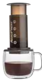
AeroPress Coffee Maker $30