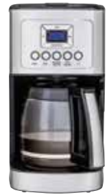
Cuisinart PerfectTemp 14-Cup DCC-3200 $100