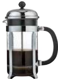
Bodum Chambord 8 Cup Coffee Maker $40

For a bold, full-bodied taste French Press