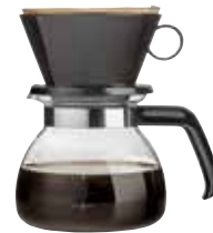
Melitta 6-Cup Pour-Over Brewer $10