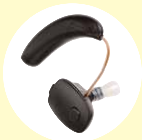
SoundWorld Solutions CS50+ $350

This rechargeable device offers some background noise reduction; settings for entertainment, everyday, and restaurant environments; and Bluetooth capability. It can be customized with a smartphone app to amplify the frequencies a user needs amplified most.