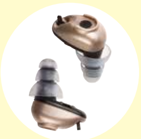
Etymotic Bean $214 ($399 if purchased as a pair)

An in-ear device that runs on disposable batteries that can last about one to two weeks, the Etymotic Bean has an omnidirectional microphone that picks up sounds around the wearer. A toggle switch controls volume levels.